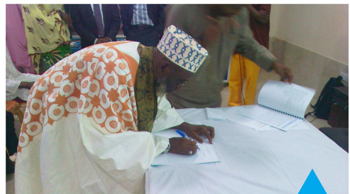
The Chairman of the National IEU Council, Sheikh Ibrahim Basha signing the new IEU Constitution.