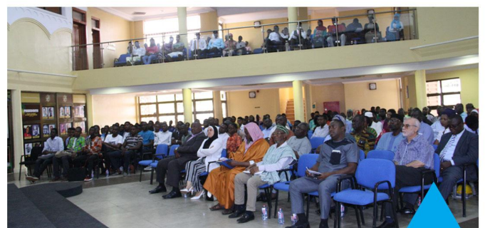
Participants at the event