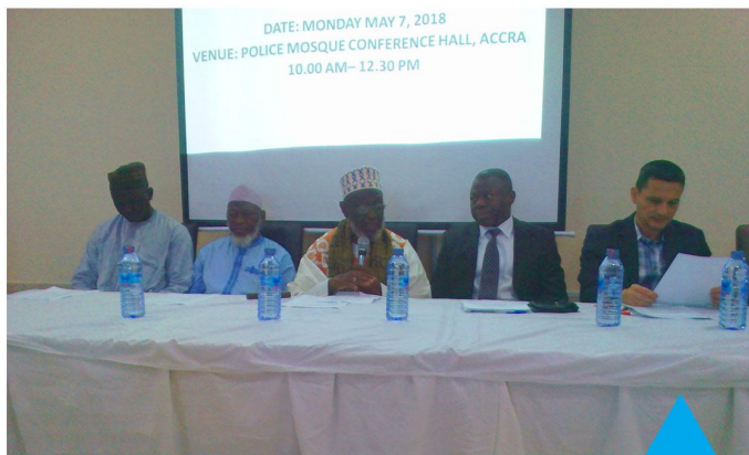
Some Members of BPI Board and some executives of the IEU National Council at the high table during the Inauguration

in Ghana (FOMWAG), Ghana Muslim Student Association (GMSA), Coalition of Muslim Organizations, Ghana (COMOG), Federation of Islamic Senior High Schools in Ghana (FISHSIG), National Council of Zongo Chiefs and Zakat, and the Zakat and Sadaqa Trust Fund of Ghana.