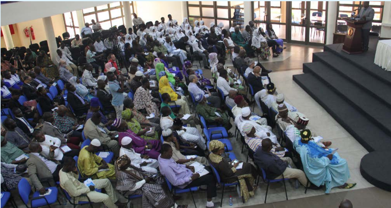
Some of the participants at the BPI 3rd Anniversary Lectures

B araka Policy Institute (BPI) on Thursday, February 23, 2017 organised its third successive anniversary lectures at the Ghana Academy of Arts and Sciences. The lecture was under the theme: “In Quest Of Life Opportunities For All-The key Issues” .