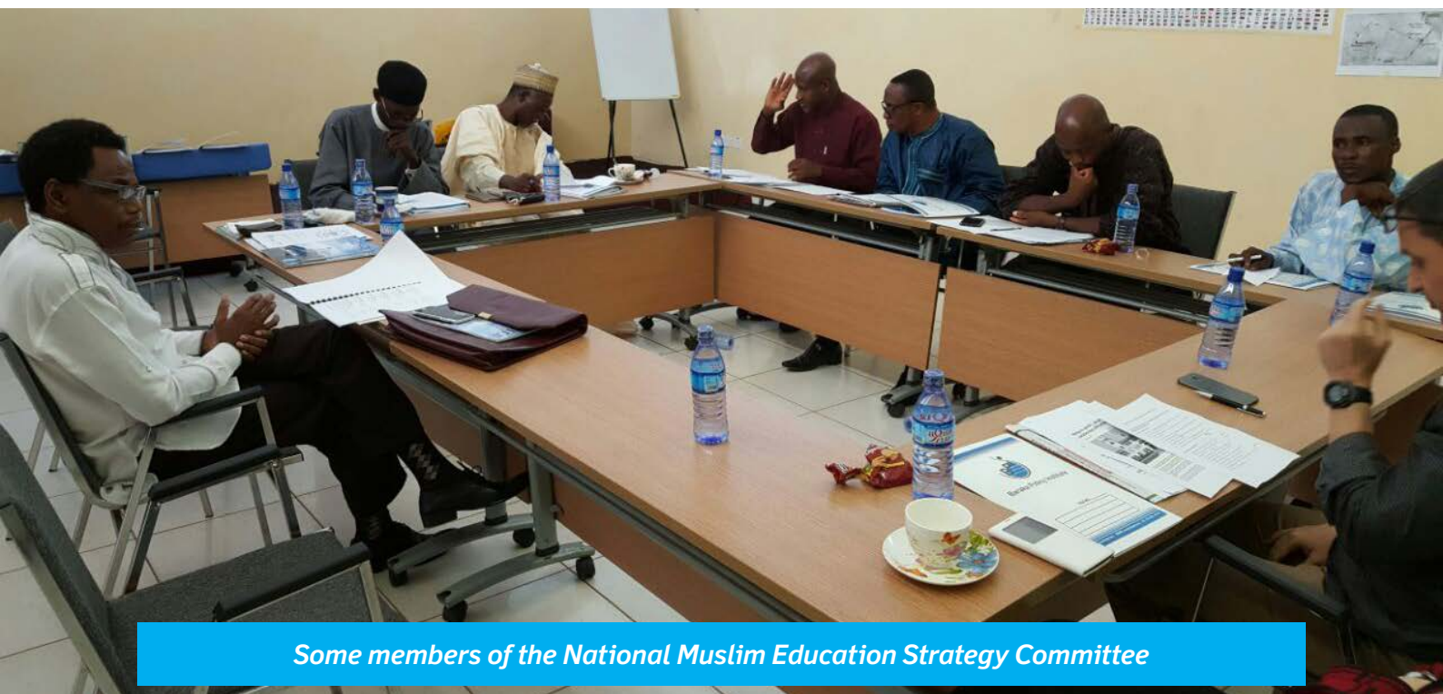
Some members of the National Muslim Education Strategy Committee

Lastly the committee is to accomplish its task within a period of 6 months beginning March, 2017 and submit the draft by 13th September, 2017.